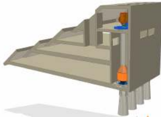
Figure 2. SSG pilot plant at Kvitsøy Island, 3-level reservoirs. Below, drawing of the device with view of the low-head turbines.