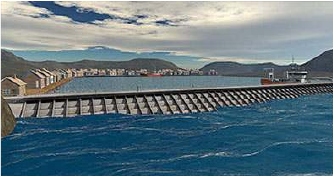
Figure 3. SSG concept applied on breakwaters.